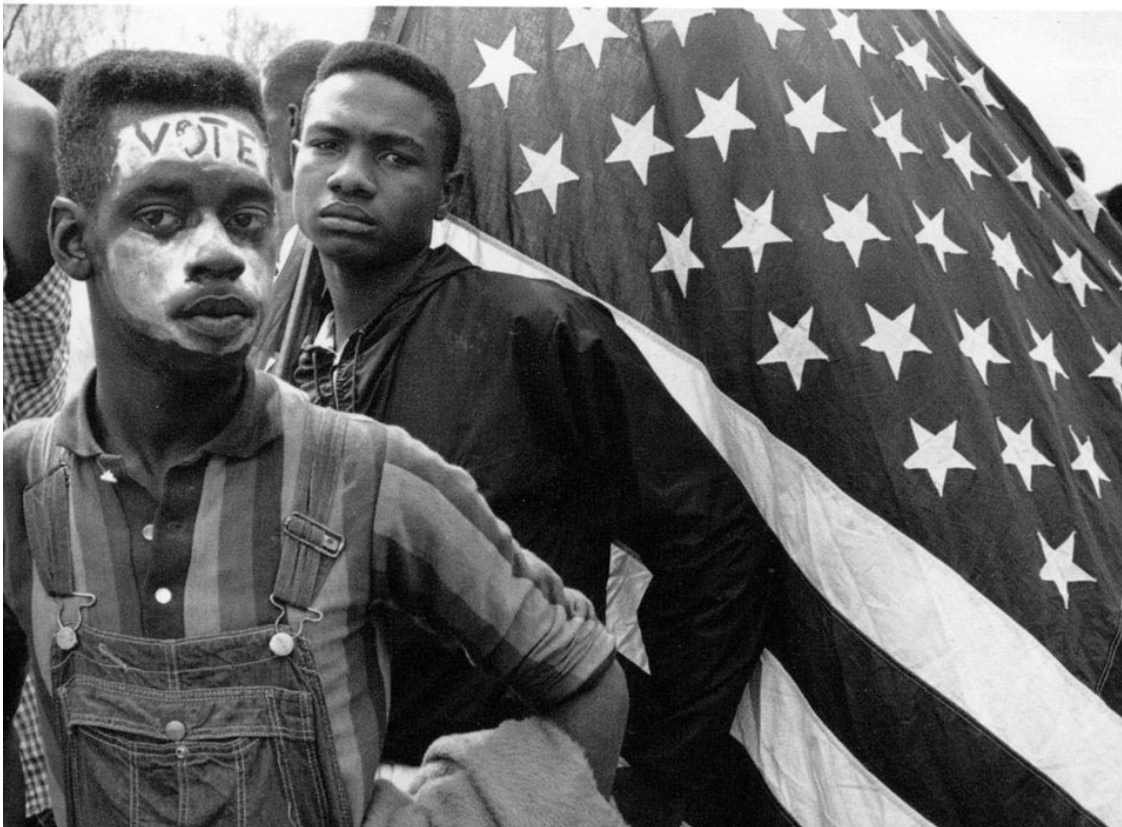
I like this one from 1965! That is so long ago the copyright if okay by now as a public domain.

When I got home I recalled what I had seen a few days earlier when watching the Mini Series Book Of Negroes. WHY, at the end of the Civil war did people think it was unsafe to stick with the North, which is now the United States...today I wonder if it really is.... why did they think they would be enslaved again. If I was one of my imaginary alien friends I might not think that is a strange question. Look at the treatment and mostly the difference in treatment of some of our citizens, and it is so clear. All indigenous people of the planet experience the same discrimination around the globe. Take a look at some of the Native American Issues, the Aboriginal Issues of Australia. So similar! There is no excuse for ignorance, use your social network and TALK to people of different ethnicities and see what you can learn. And then of course we have other problems also. Floods, food shortages, extreme heat waves across the world. Sun-flare entering with Earth Gravity, all the problems which we should really work on as a collective human race.